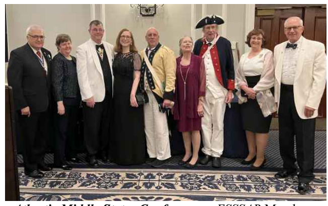
Atlantic Middle States Conference – ESSSAR Members